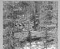
Full Service Timber Manufacturing and Harvesting