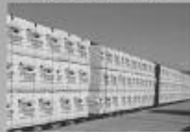
Quality Packaged Product