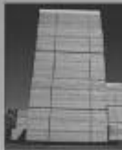
No Prior Select Studs