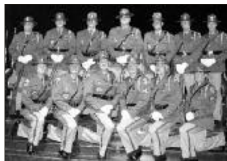
On May 15, 2009, as a part of National Police Week and Memorial Day ceremonies, the Montana Highway Patrol Honor Guard gathered in Helena, honoring those who have served and died in the line of duty.