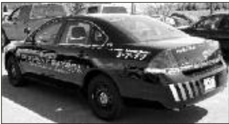
In the fall of 2009, Montana Highway Patrol cars will have a new look, with new graphics. On the rear quarter panels, the Patrol's motto of "Service, Integrity, Respect," as well as the infamous "3-7-77" of the Vigilantes will be prominently displayed. On the rear of the car, the Patrol's 75 th anniversary (1935-2010) will be celebrated. For 2010, all new patrol cars will be Chevrolet Impalas.

The six Optimist Clubs of the greater Billings area recognize members of local law enforcement agencies for outstanding work with young people of the community.