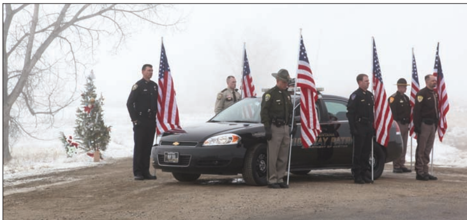
Location of incident.