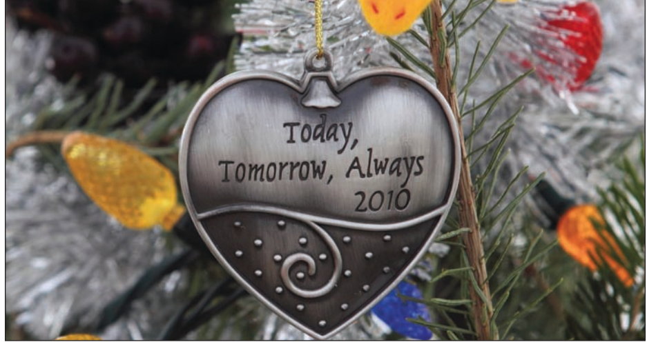
Messages on tree.