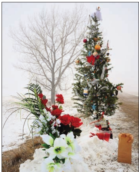
Tree at location of incident.