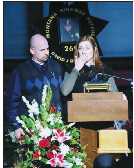
Family members speaking.