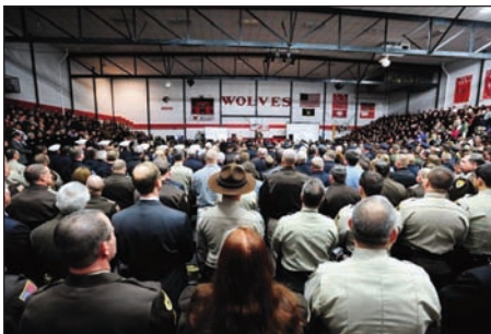
Gymnasium.