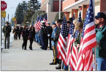
Flags at entrance.

spoke of small towns and memories played in the background. The photos of the little boy dressed in Halloween costumes already resembled the young man who would achieve his lifelong dream of following his father's footsteps and becoming a Highway Patrol trooper.