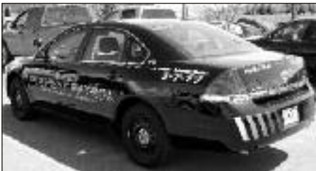
In the fall of 2009, Montana Highway Patrol cars will have a new look, with new graphics. On the rear quarter panels, the Patrol's motto of "Service, Integrity, Respect," as well as the infamous "3-7-77" of the Vigilantes will be prominently displayed. On the rear of the car, the Patrol's 75 th anniversary (1935-2010) will be celebrated. For 2010, all new patrol cars will be Chevrolet Impalas.

The six Optimist Clubs of the greater Billings area recognize members of local law enforcement agencies for outstanding work with young people of the community.