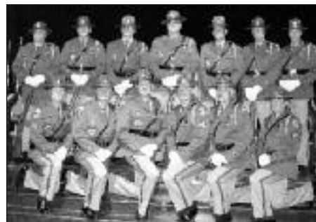
On May 15, 2009, as a part of National Police Week and Memorial Day ceremonies, the Montana Highway Patrol Honor Guard gathered in Helena, honoring those who have served and died in the line of duty.