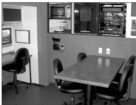
Officers' work area.